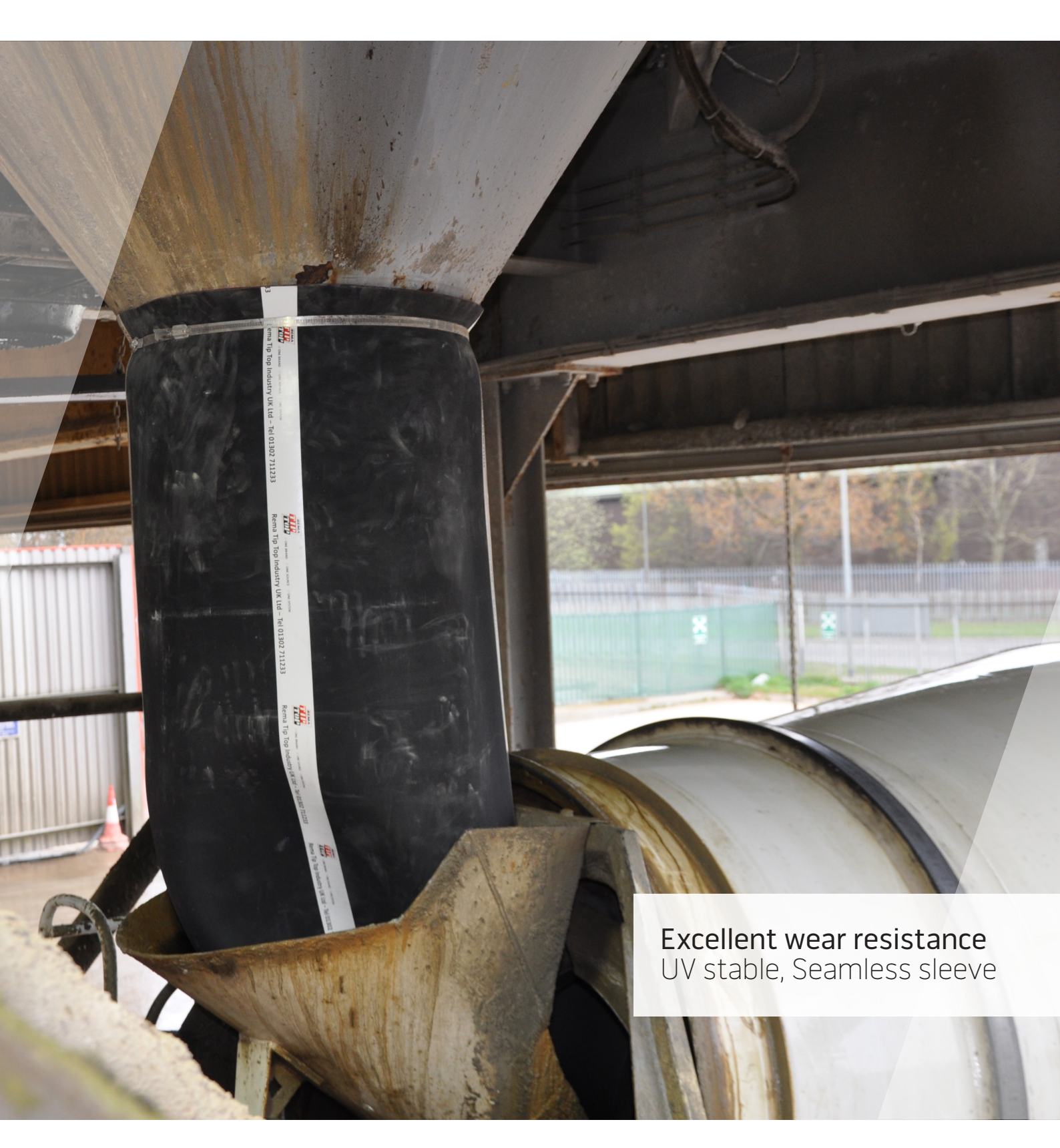
REMATIPTOP - CONCRETE DISCHARGE CHUTE