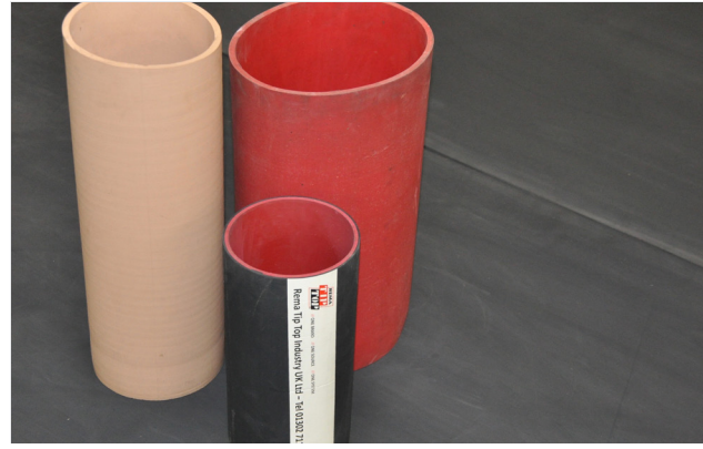
Industrial product grades