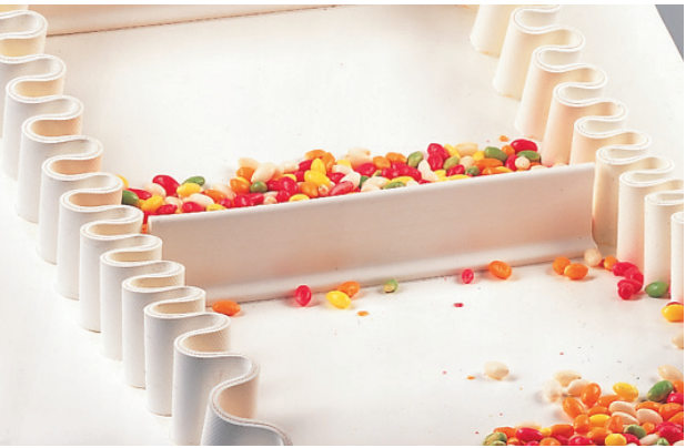
Extensive belt solutions